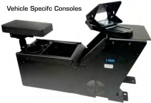
Vehicle Specific Consoles