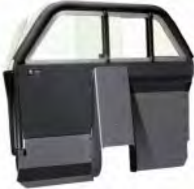
multiple configurations available