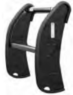
multiple configurations available